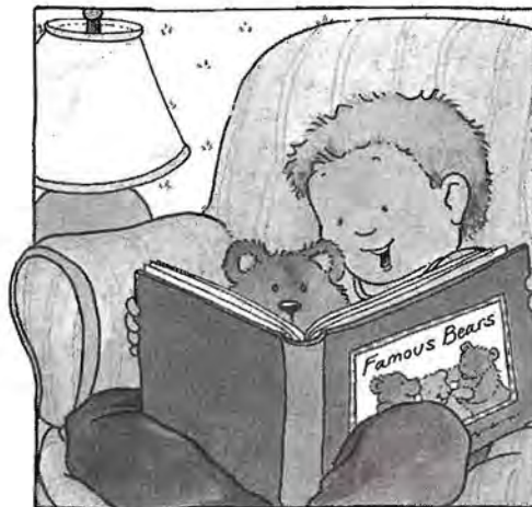
5 My bear can read.