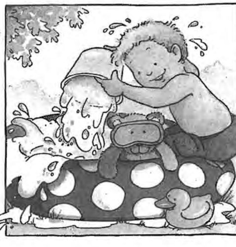
7 My bear can swim.