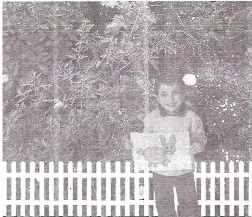
It is for bunny.