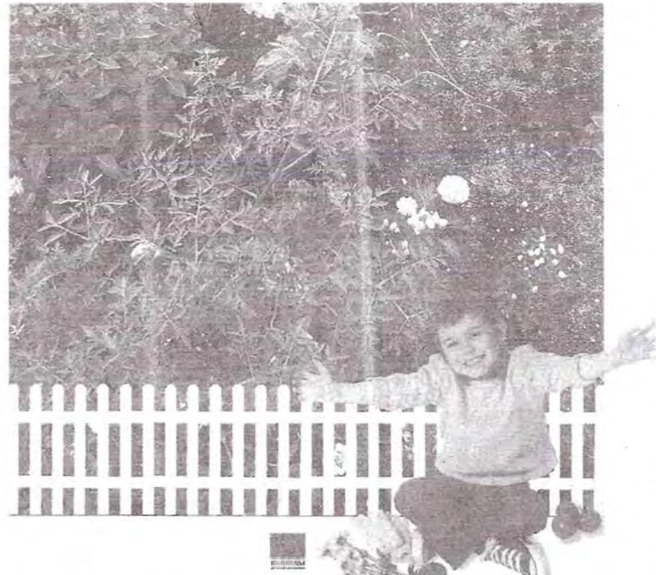
He likes the garden.