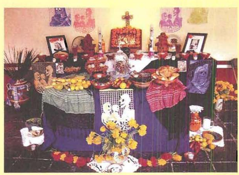
Each item on an offering table holds special meaning for families remembering their loved ones.

We believe they will come back because they miss us, too. And they love to eat bread with bones on it!