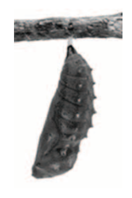
This is a _