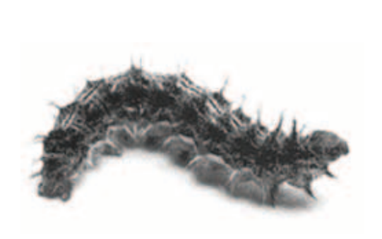
This is a _