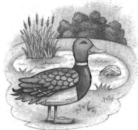
I see a duck.