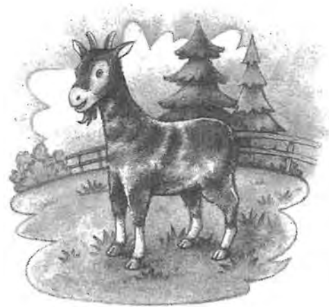
I see a goat.