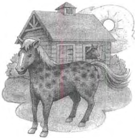
I see a horse.