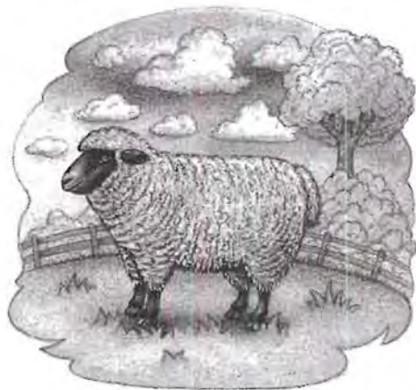
I see a sheep.